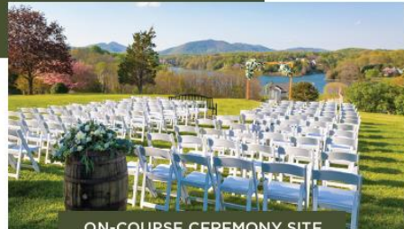
ON-COURSE CEREMONY SITE

IVY HILL GOLF CLUB IS PERFECT FOR SOCIAL EVENTS, RECEPTIONS, BIRTHDAY PARTIES — EVEN WEDDINGS!