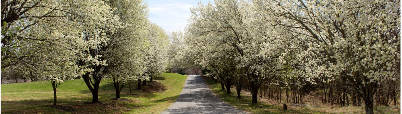
Banner Photo by Bill Hite