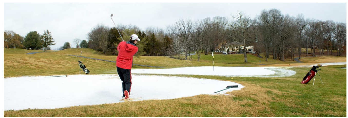
Banner Photo by Bill Hite