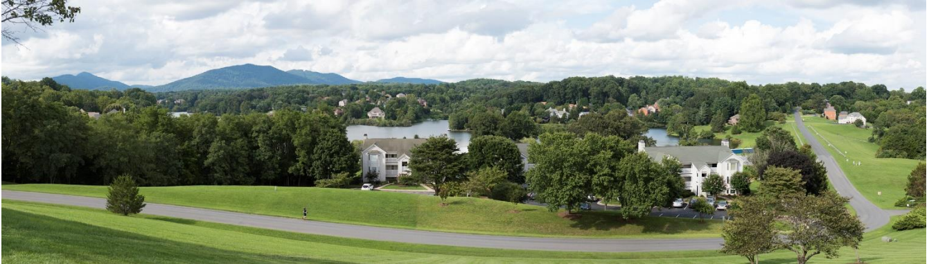
Banner Photo by Bill Hite