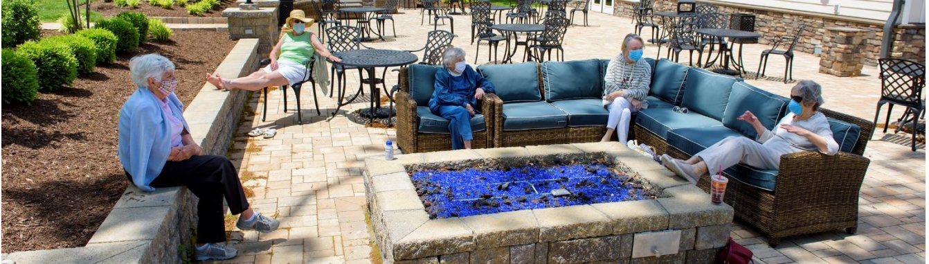
Banner Photo by Bill Hite