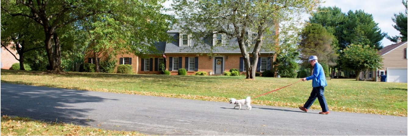
Banner Photo by Bill Hite