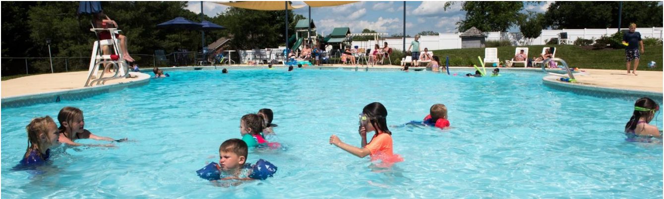
Banner Photo by Bill Hite