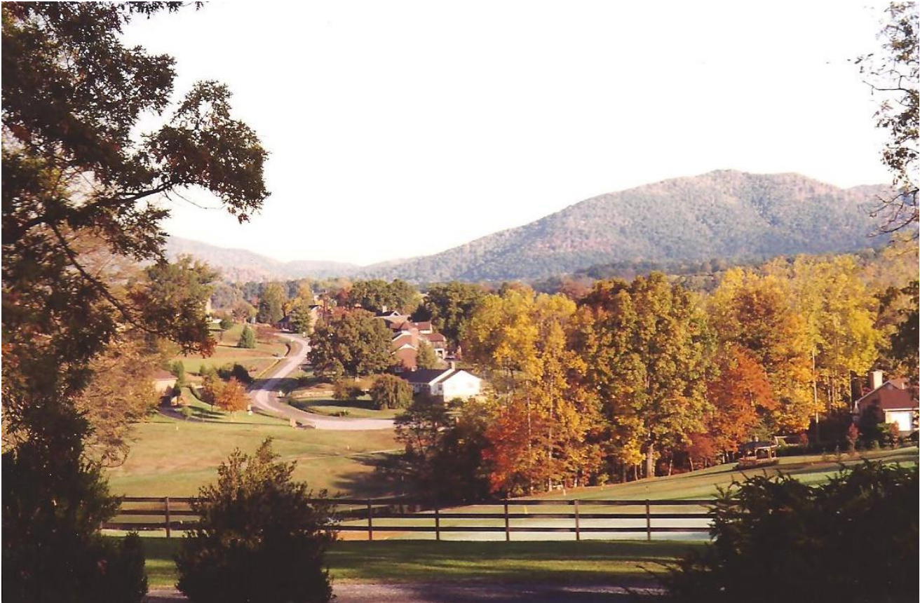
Ivy Hill circa 1980