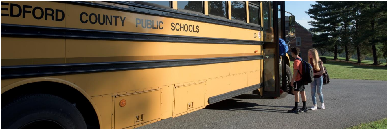
Banner Photo by Bill Hite