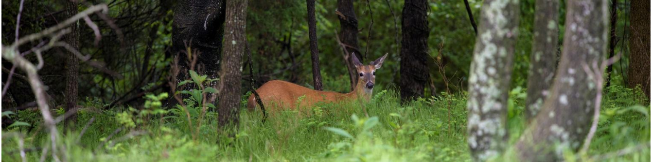
Banner Photo by Bill Hite