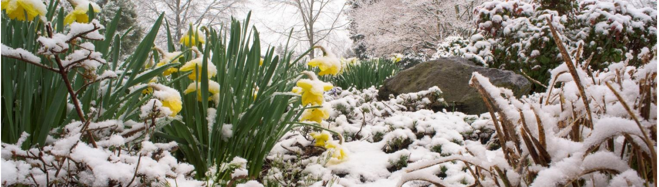
Banner Photo by Bill Hite