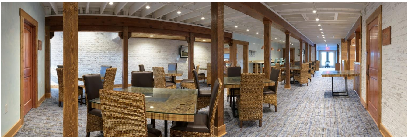
Ivy Hill Clubhouse Renovations

Telephone: (434) 846-1504 Fax: (434) 846-6407 emergencyvets@comcast.net