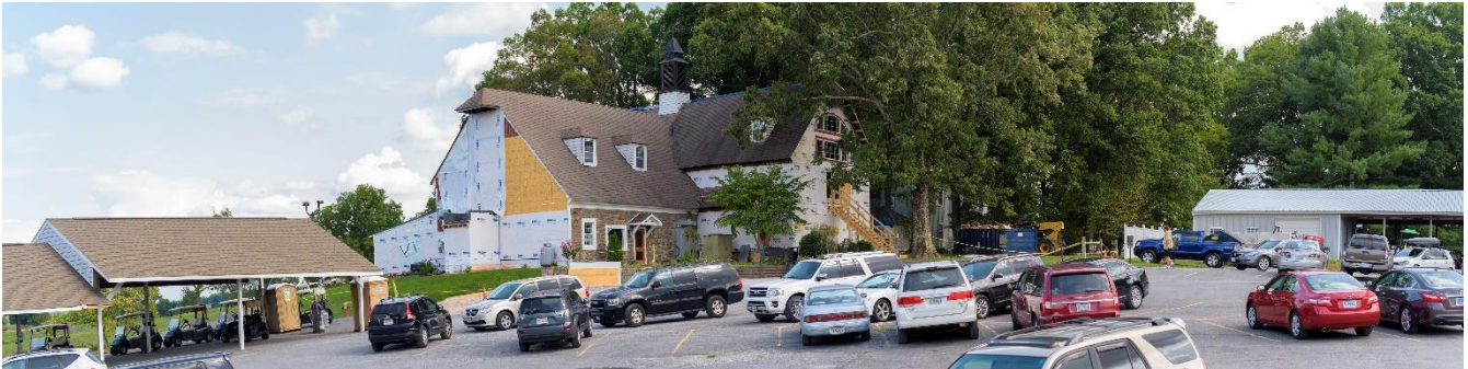
Banner Photo by Bill Hite