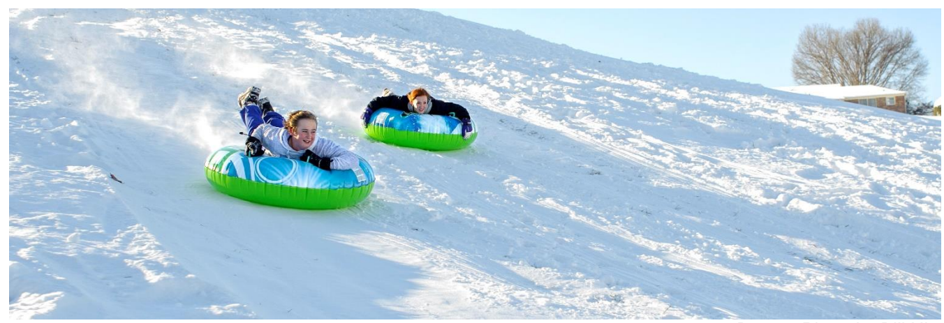
Banner Photo by Bill Hite