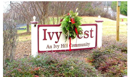
Second Runner Up - Ivy West