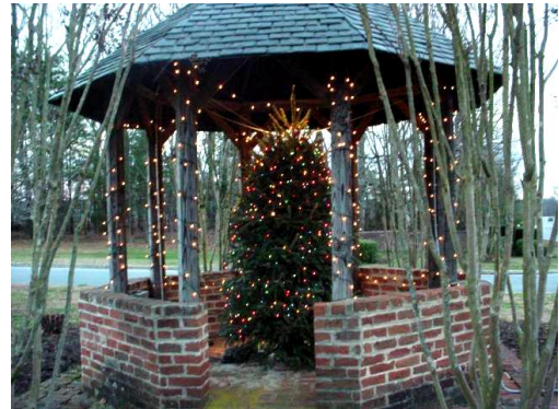
First Runner Up - Ivy Hill Main Entrance