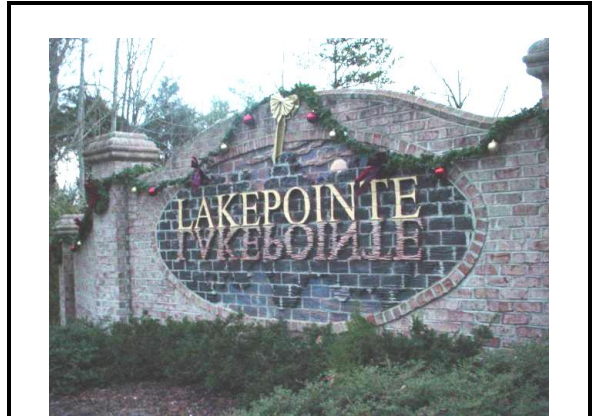
First Place - Lakepointe!

Not a member of the Friends of the Forest Library? Ask the librarian at the front desk and they will be only too happy to provide you with a membership application.